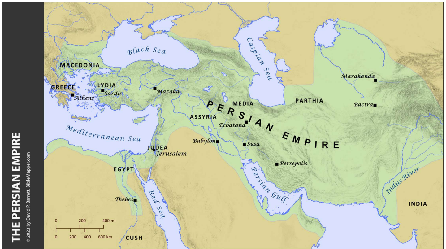
The Persian Empire Map.

In 539 B.C., Cyrus the Great of Persia defeated the Babylonians, and a year later he decreed that the Judeans who had been sent into exile were allowed to return home and rebuild the Temple (2 Chronicles 36:22-23; Ezra 1:1-2). Under the leadership of Zerubbabel, a small contingent of Judeans made the long journey and re-established Judea as a very small district in the much larger Persian province called 'Beyond the River'. This vast empire was the world of Ezra, Nehemiah, and Queen Esther.