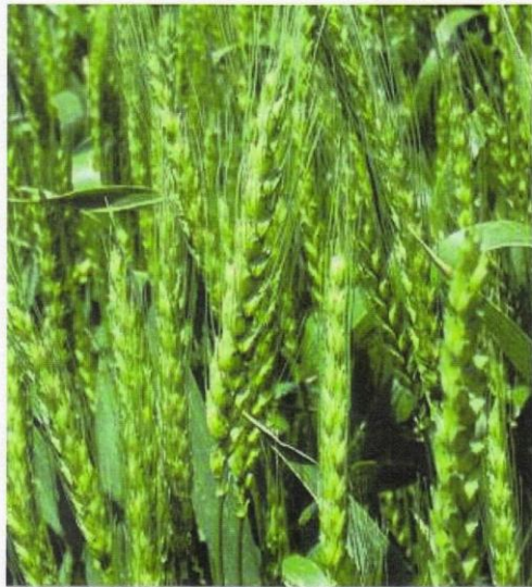
WHEAT: before it is fully ripe.