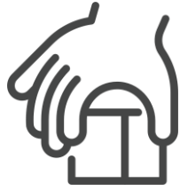
Gross Motor skills